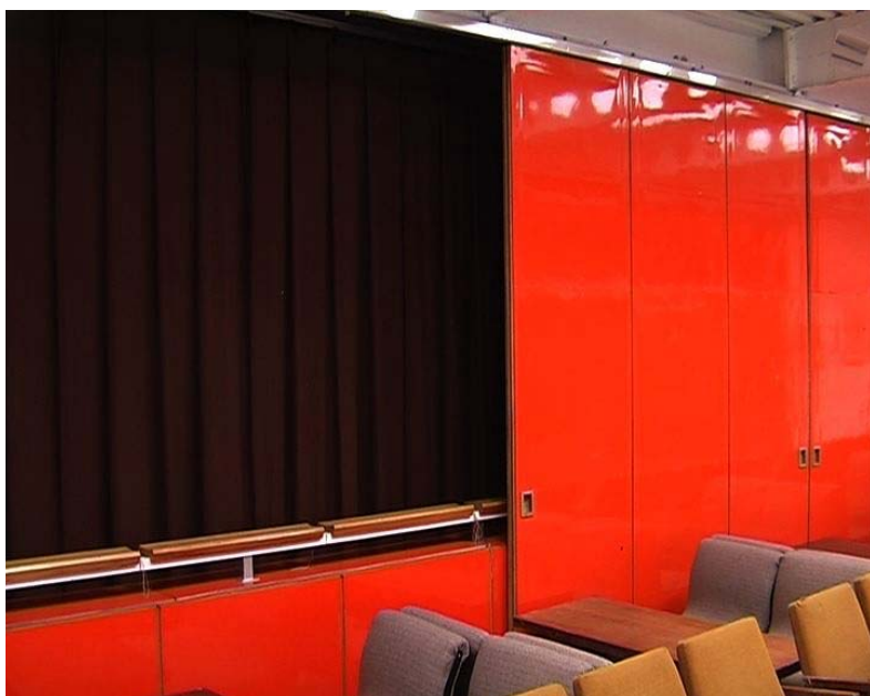
Andreas Fogarasi, A Machine for , 2006, video, 8 min, videostill

The exhibition and the catalogue of the Hungarian Pavilion are supported by the National Cultural Fund and the Ministry of Education and Culture with the contribution of Múcsarnok / Kunsthalle, Budapest.